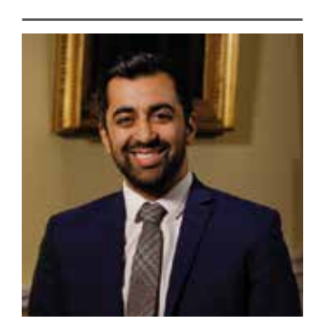
Humza Yousaf Cabinet Secretary for Justice

Human trafficking and exploitation are crimes that prey on the most vulnerable in society, both within Scotland and across the world. They are abuses of human rights that have life-changing negative impacts for victims.