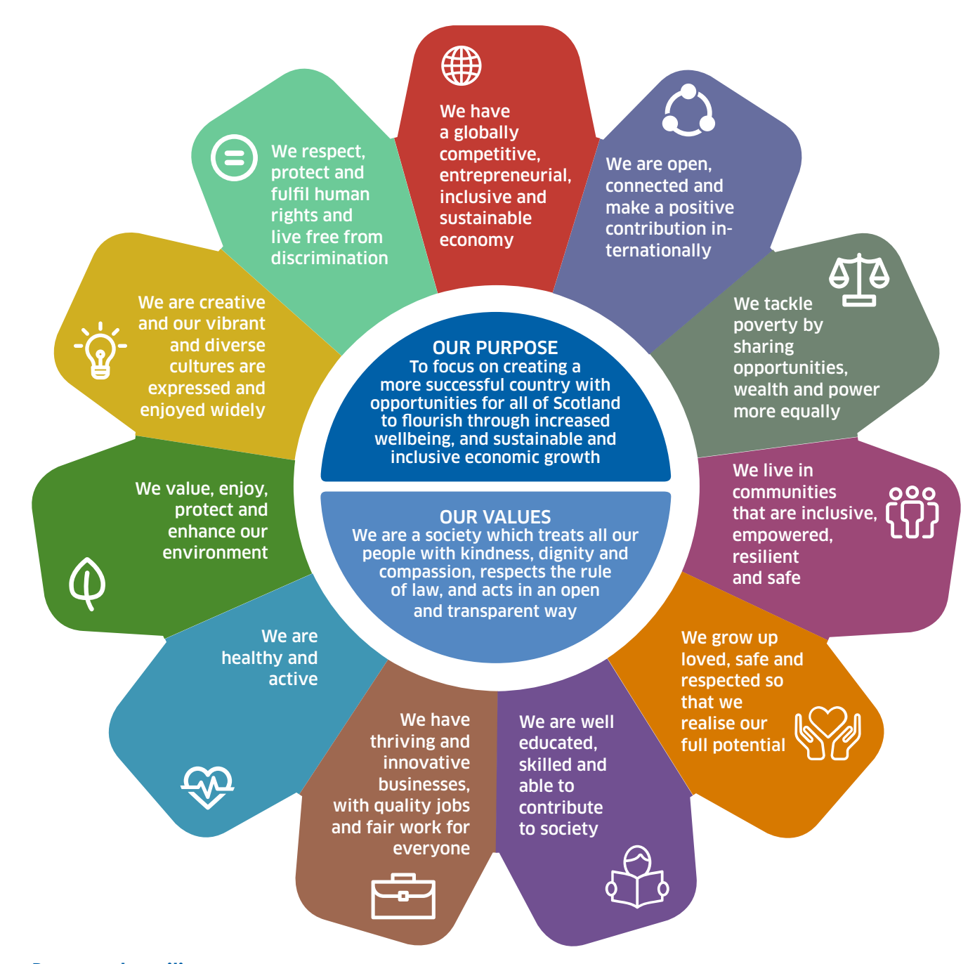
Figure 1: Scotland's National Performance Framework