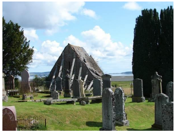
St Michaels Church and burial ground, Kirkton Slabs to relocate to Gun Munro Mausoleum above