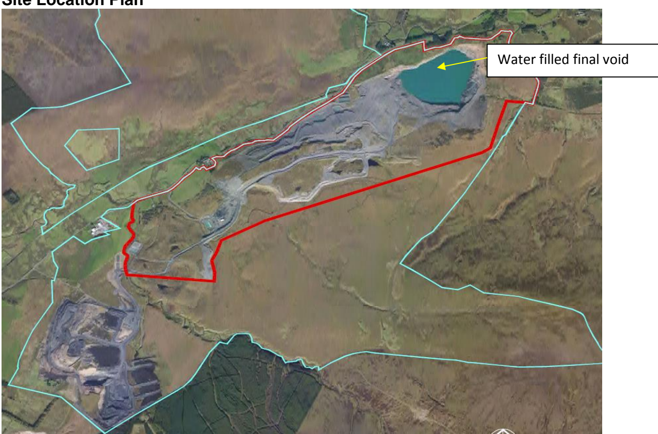
Application boundary (red line) and Mine RestorationLtd ownership boundary (blue line)