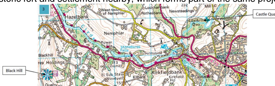
Location Plan of Black Hill and Castle Qua.