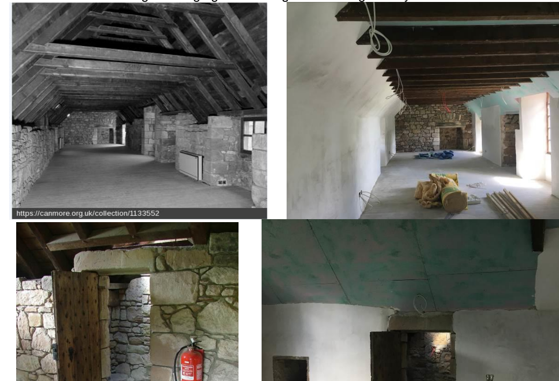
Photographs showing 'before works' and 'after works' - Room 49 Long Gallery