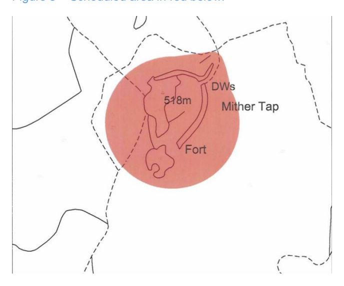
Figure 3 – Scheduled area in red below.