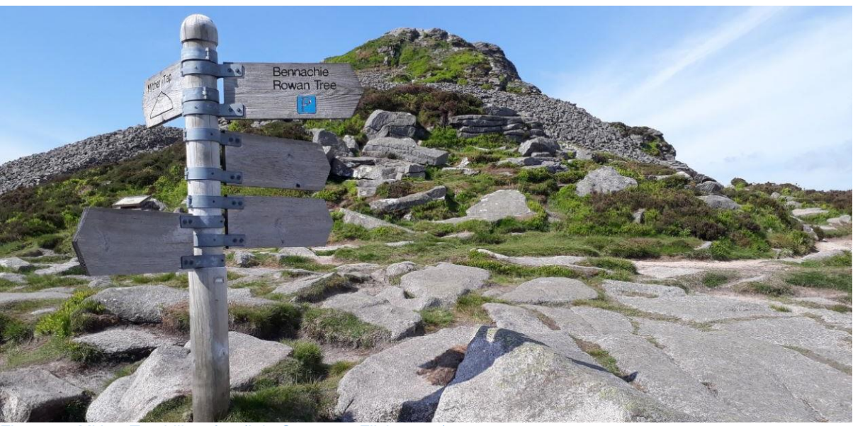
Figure 1 - Mither Tap hilltop fort