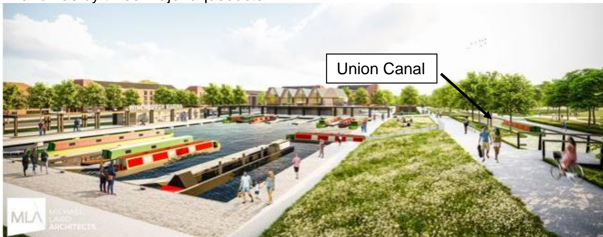
Figure 1 - Proposed Marina (MLA)

is a continuous watercourse, over 31 miles long, was without need of a single lock and has by three major aqueducts.