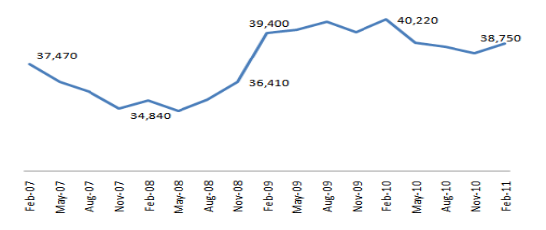
Figure 2 Total out of work benefit claimants

• The upsurge in JSA means that the total number of benefit claimants has increased since the low of 34,840 in early 2008