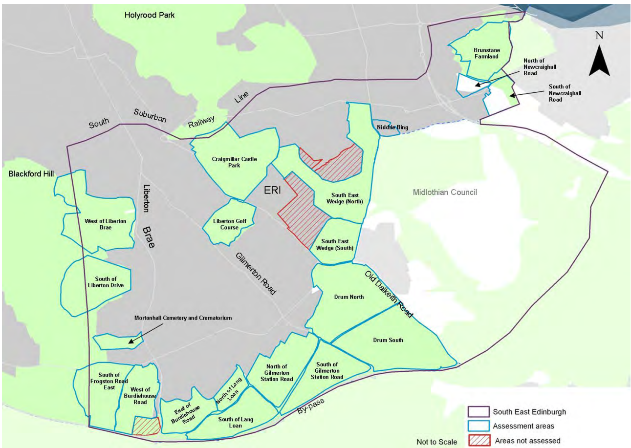
South East Edinburgh assessment areas