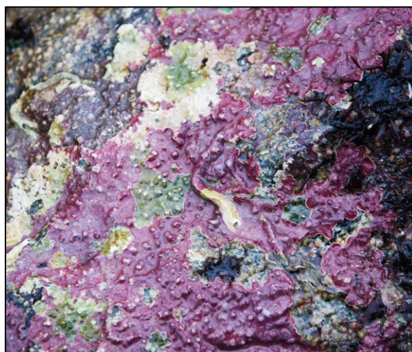
Asstd. encrusting red algae

A fairly sparse mobile fauna of the crustacean, Carcinus maenas , the gastropods, Littorina littorea and Gibbula cineraria and the starfish, Asterias rubens was recorded.