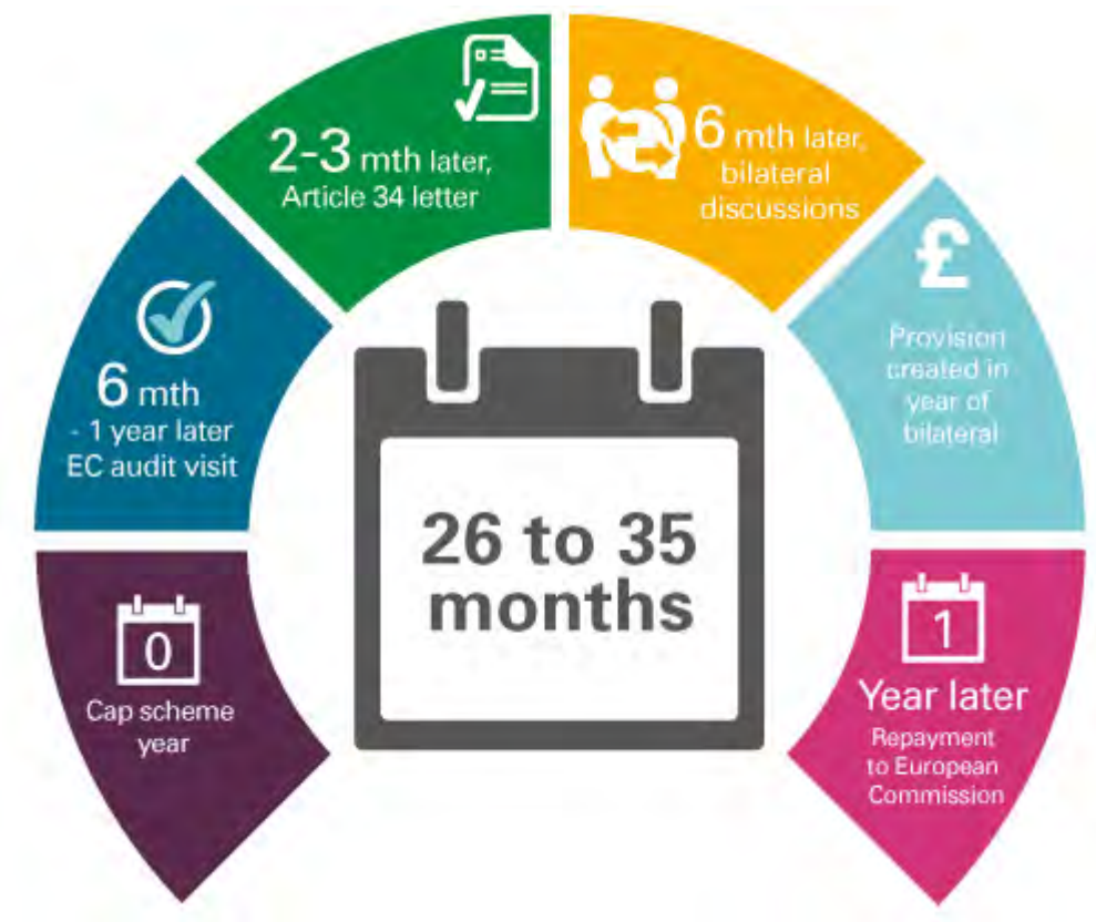
Exhibit 6 Time lag between CAP scheme year and repayment to the European Commission