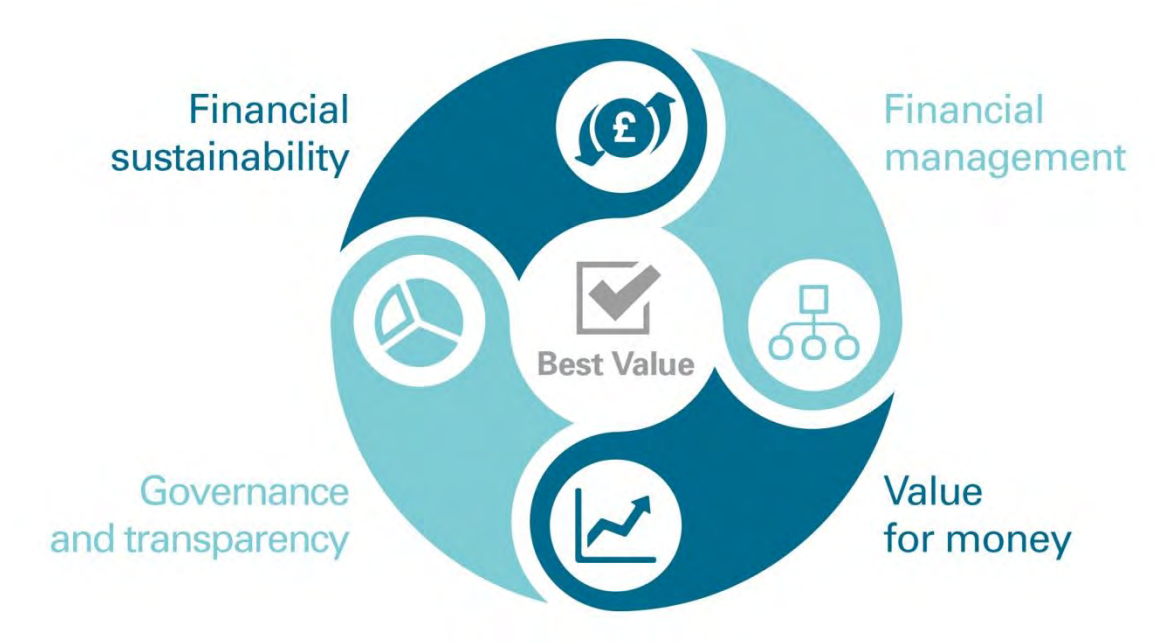
Exhibit 1 Audit dimensions