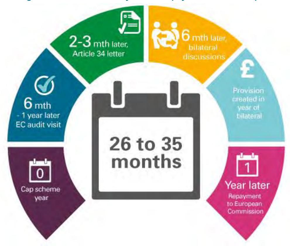
Exhibit 6 Time lag between CAP scheme year and repayment to the European Commission