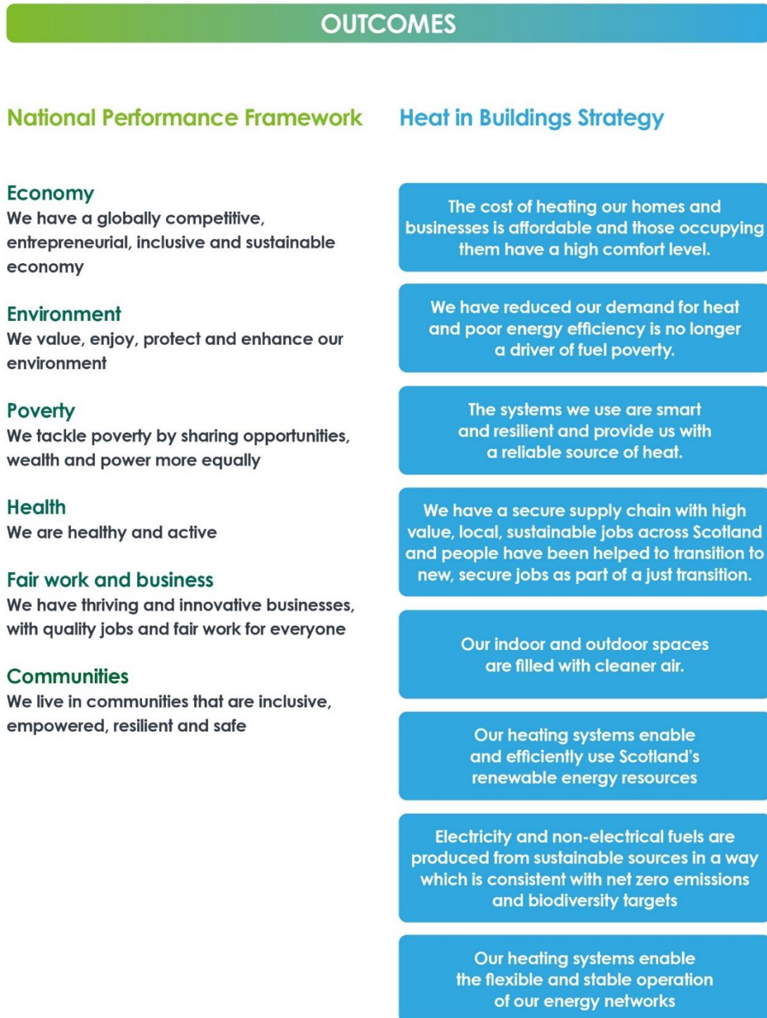
Figure 1 – Draft Strategy Outcomes

The vision is underpinned by energy efficiency and heat decarbonisation supporting outcomes as detailed in Figure 1.