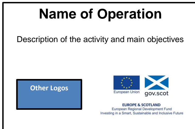
Figure 1. Billboard: