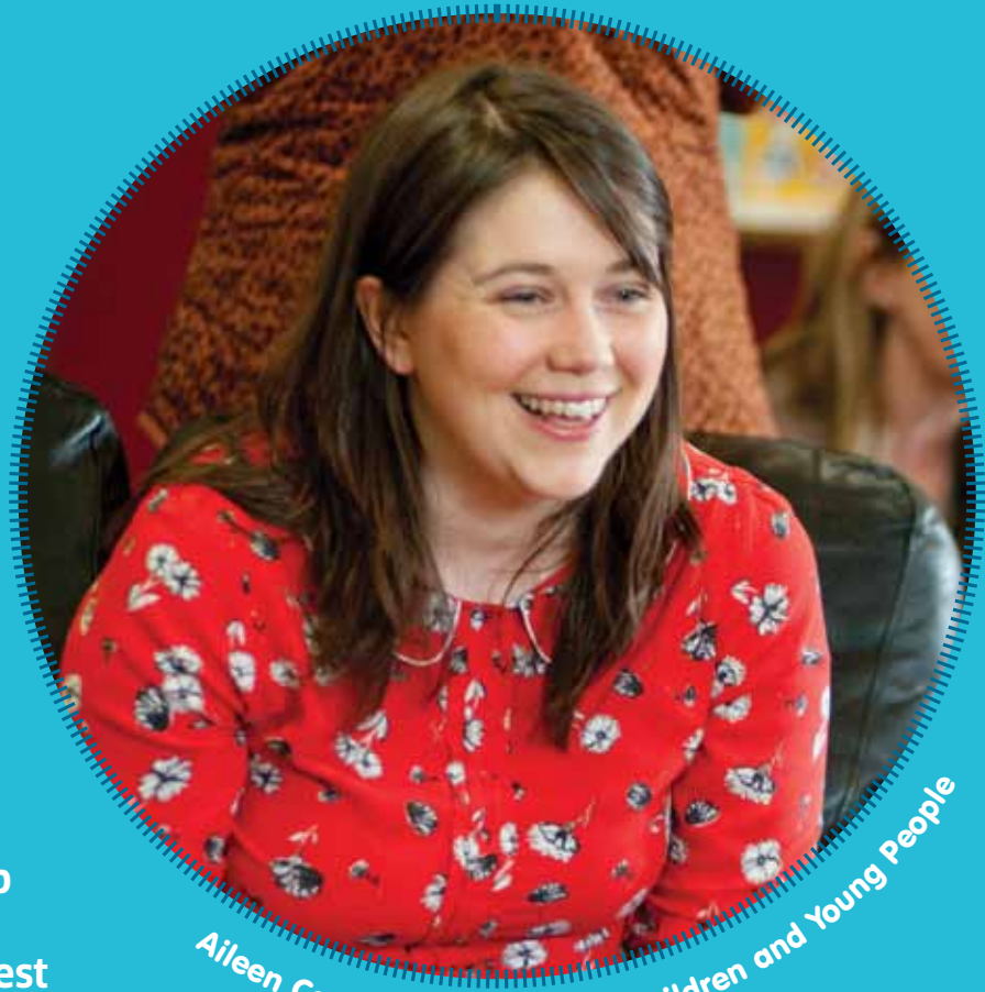
Aileen Campbell, Minister for Children and Young People

I want Scotland to be the best place in the world for children and young people to grow up. To achieve this, one of the key things we need to do is ensure that all parents feel valued and supported to develop their own potential, knowledge, skills and confidence to be the best they can be for their children. This is why we have made a commitment to develop a national parenting strategy. By this we mean a national statement setting out our vision to support parents and carers across Scotland.