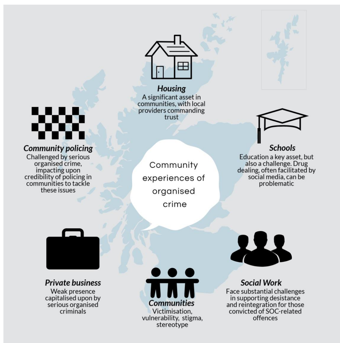
Fig 1. Services providers: Summary of key points in case study areas