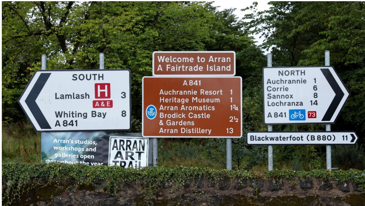
Which Way Now?