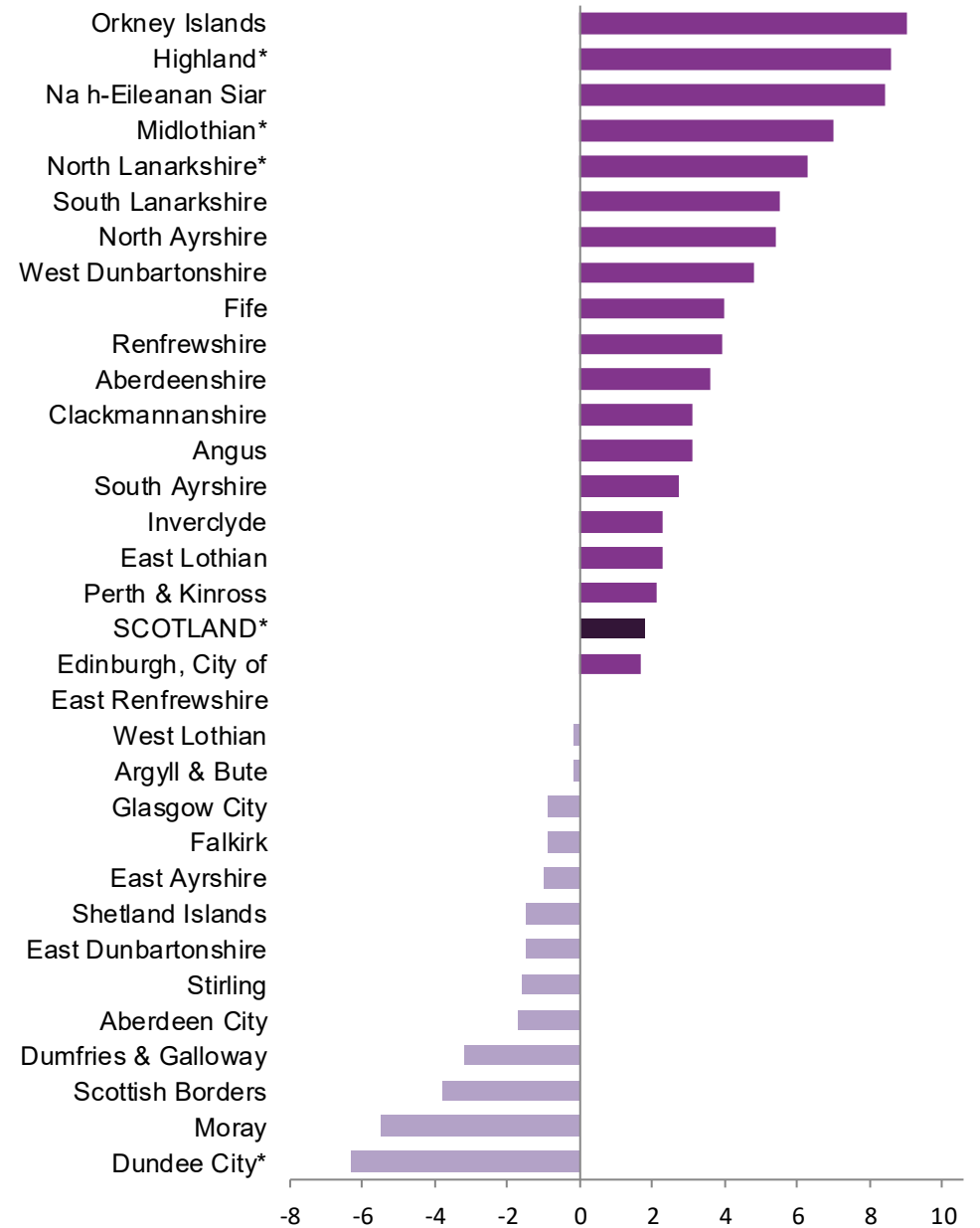
Chart 3: Change in Employment Rates for women between July 2007-June 2008 and July 2017-June 2018 (percentage points)

18 local authorities in Scotland have higher employment rates for women than ten years ago, while 13 showed a decrease and one remained unchanged. Statistically significant changes were seen over this period in Dundee City (down from 68.8 per cent to 62.4 per cent), Highland (up from 75.3 per cent to 83.9 per cent), Midlothian (up from 73.2 per cent to 80.2 per cent) and North Lanarkshire (up from 65.0 per cent to 71.3 per cent) as well as Scotland overall.