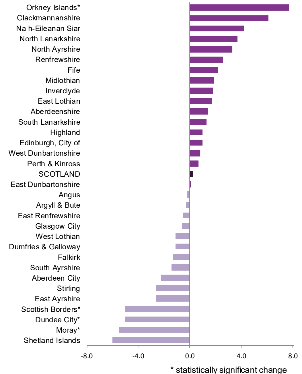
Chart 1: Change in Employment Rates between July 2007-June 2008 and July 2017-June 2018 (percentage points)

17 local authorities in Scotland have higher employment rates than ten years ago, while 15 showed a decrease. Statistically significant changes were seen over this period in Orkney Islands (up from 81.4 per cent to 89.1 per cent), Dundee City (down from 70.0 per cent to 65.0 per cent), Scottish Borders (down from 79.1 per cent to 74.1 per cent) and Moray (down from 78.4 per cent to 72.9 per cent).