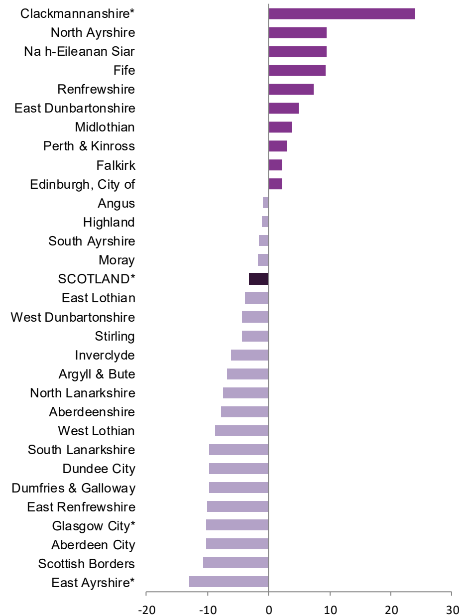
Chart 2: Change in Youth Employment Rates between July 2007-June 2008 and July 2017-June 2018 (percentage points)

Note: Data for Orkney Islands and Shetland Islands are not available