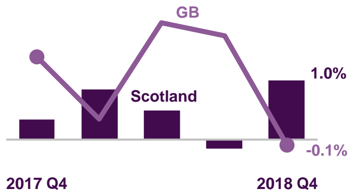
Growth in Sales Value

Over the same period, the value of retail sales in Great Britain as a whole decreased by 0.1%