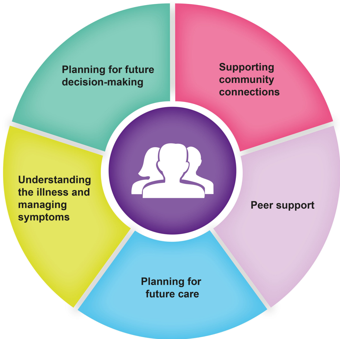
Figure 1: Alzheimer Scotland’s 5 Pillars Model of Post-Diagnostic Support

The development of the 5 Pillars Model and the post-diagnostic service offer was originally framed with a focus on people receiving an early diagnosis and living at home or in the community, with little formal health or care service support.