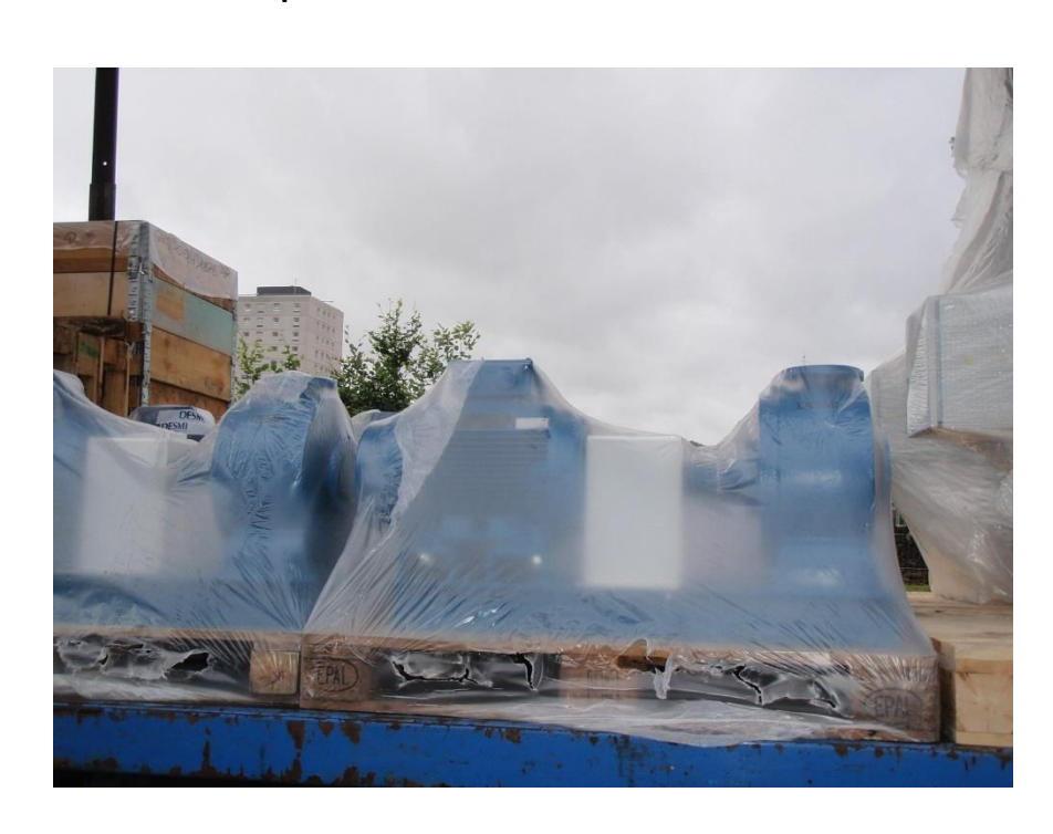
Vessel 1 – Flap Rudders Delivered to Store