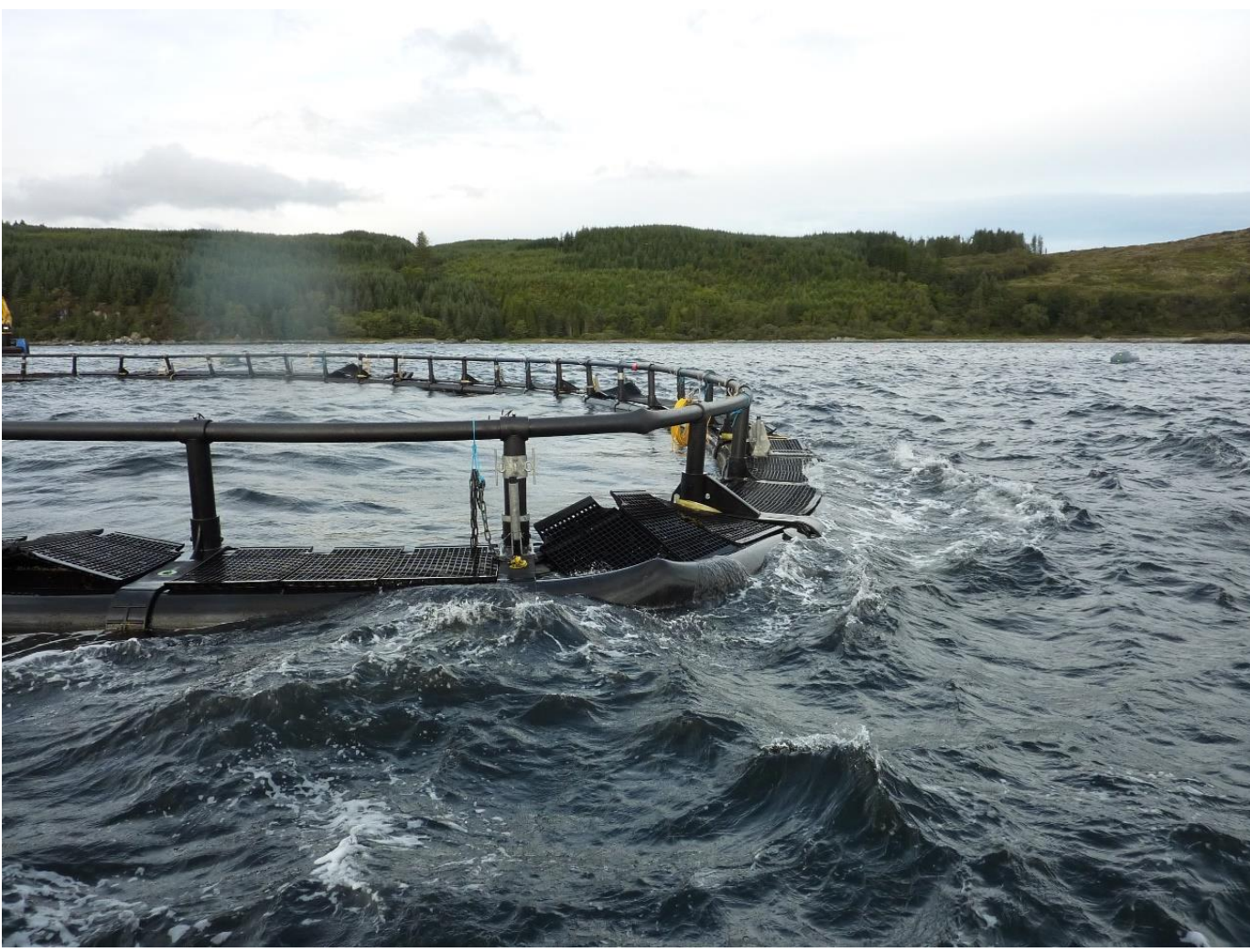
Figure 6: Cage 1 on the day of the physical inspection