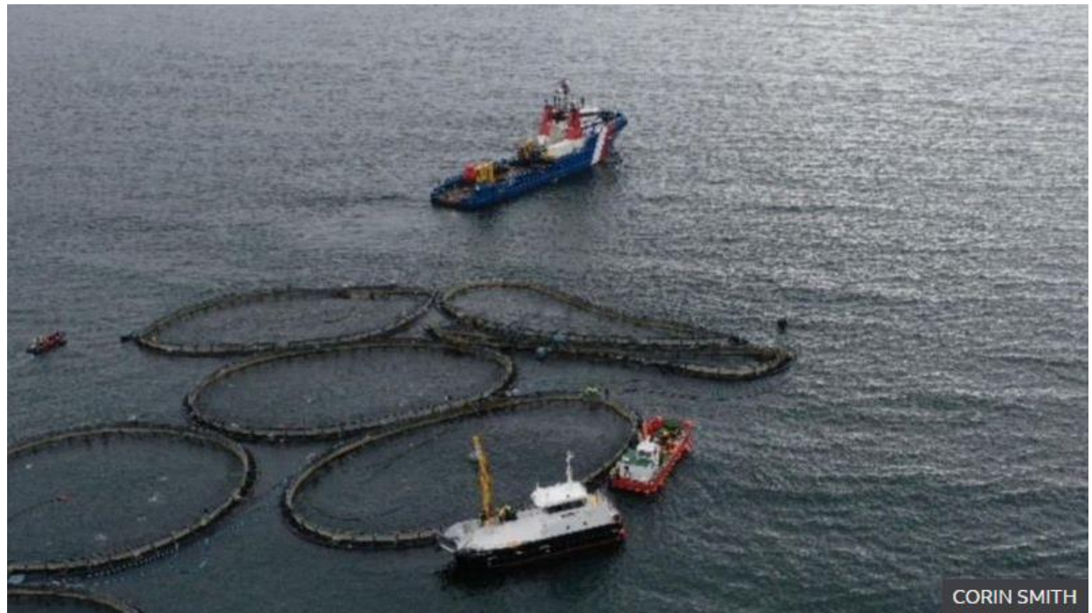
Figure 3: Drone photo of cages following the incident