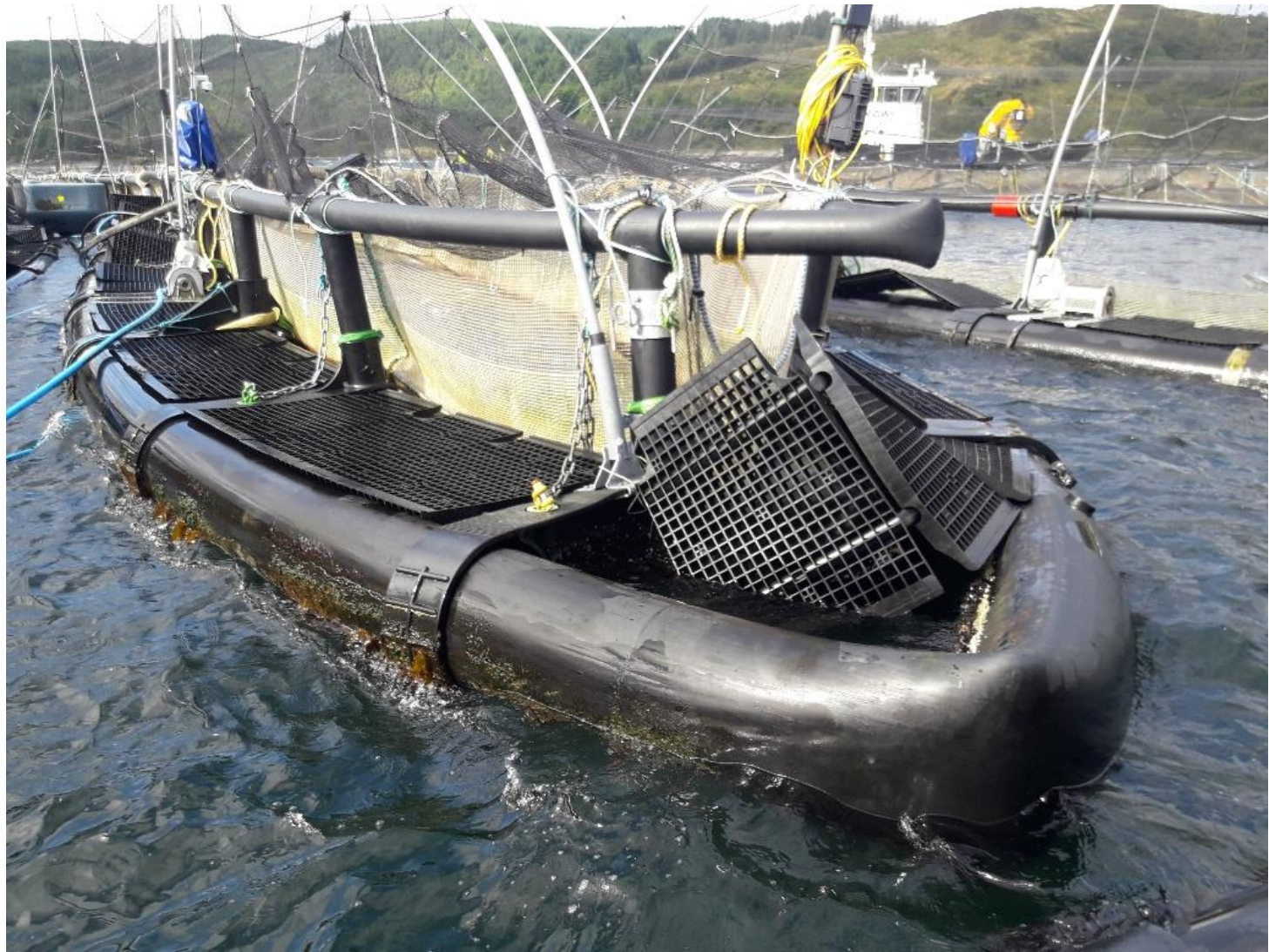
Figure 1: Cage 1 the day following the incidient (21/08/2020)