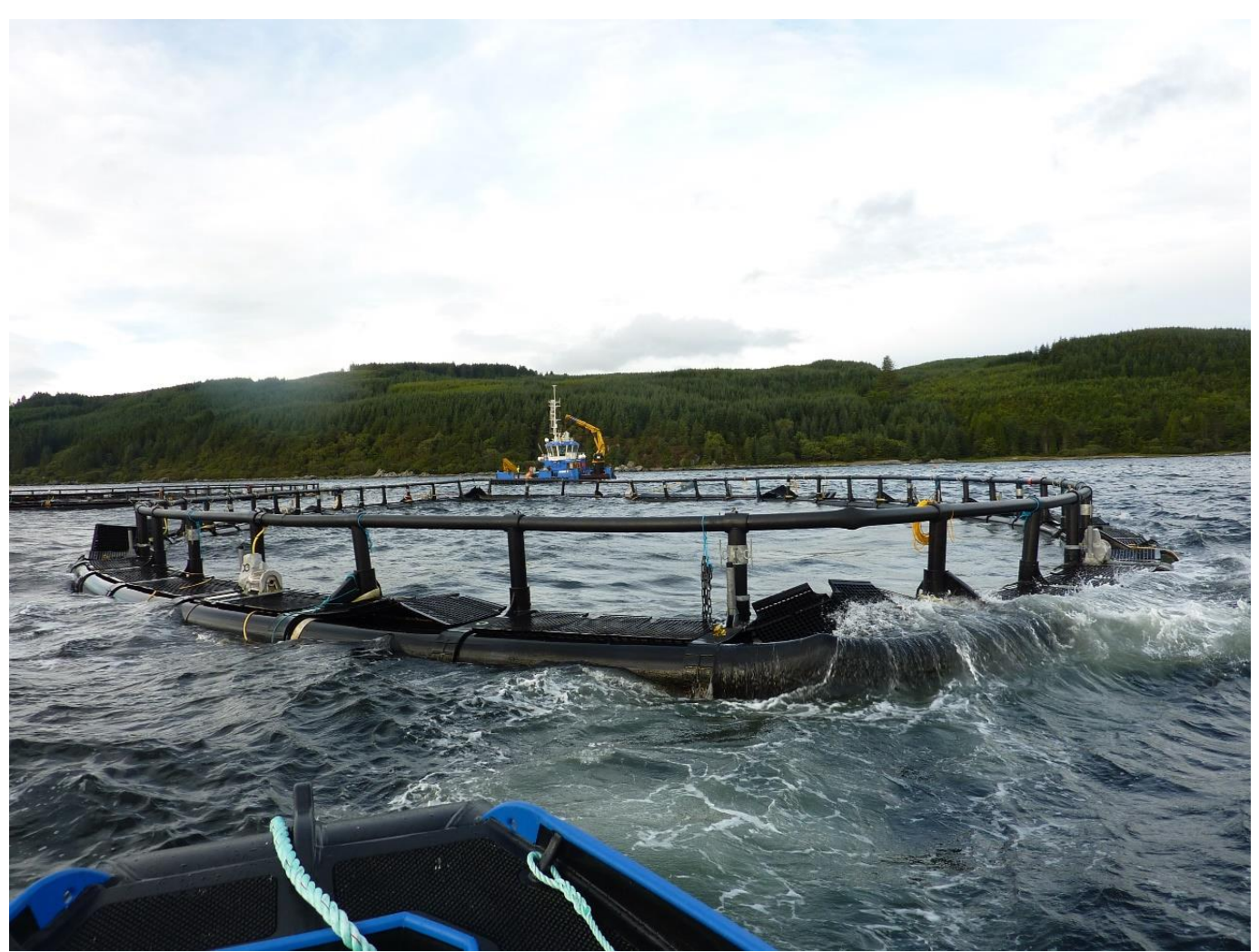
Figure 5: Cage 1 on the day of the physical inspection