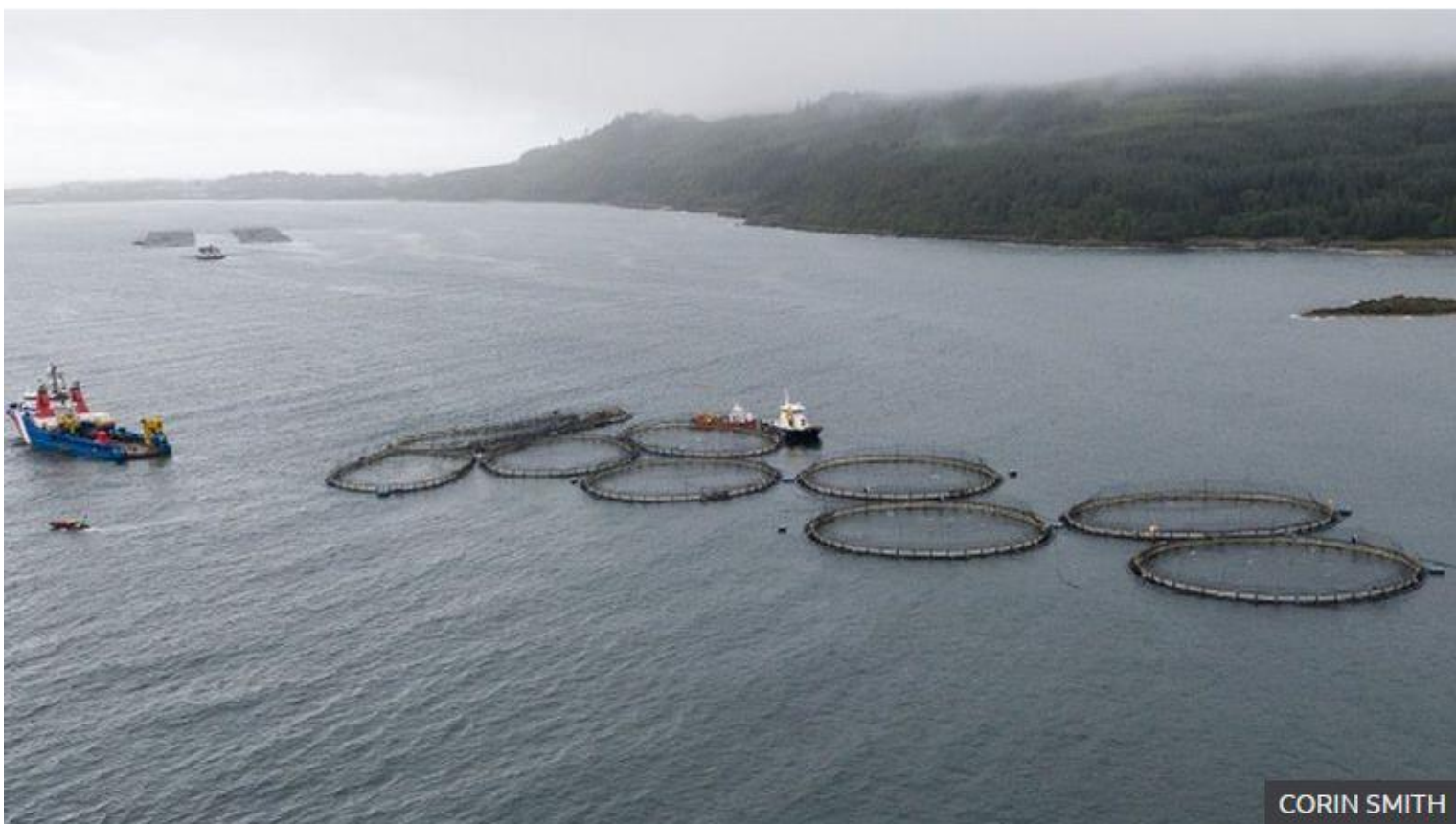
Figure 2: Drone photo of the cages following the incident